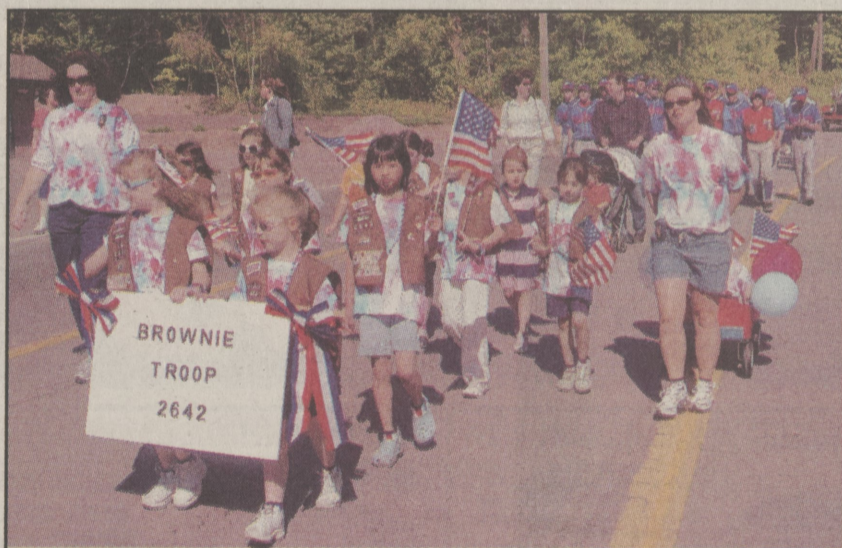
Members of Brownie Troop 2642 play a big part in the parade.