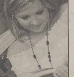
Minimize Summer Learning Loss Accelerate Learning Loss

•Accelerate Learning •Strengthen Skills •Fill-In Learning Gaps •Private Instruction or group class