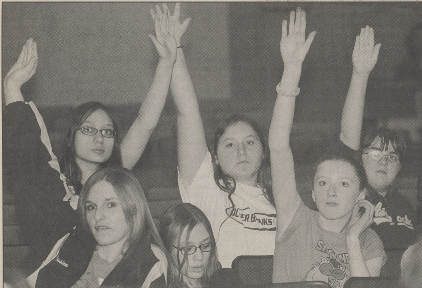
Middle school students played an audience participation game show after media Day at Lake-Lehman High school. The students learned the do's and don't's of the Internet.

The program ended with a game show, allowing parents and students to compete in an exciting exchange of information that was not only fun, but reiterated everything they learned throughout the day, conclusively showing families how they can enjoy the media together.