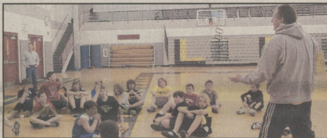
Fifth and sixth graders listen intently to what the coach says during a recent basketball clinic at the Lake-Lehman High School gym.

Junior and senior varsity basketball coaches from the Lake-Lehman School District offered a basketball clinic for fifth and sixth graders recently at the high school gymnasium.