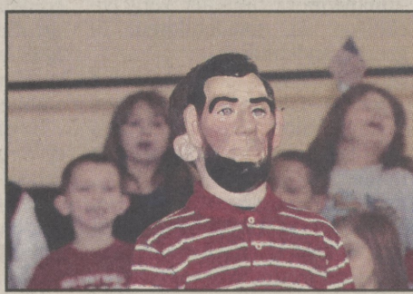
ABOVE: First graders at Wycallis Elementary School, Dallas, really get into a patriotic program of song presented for Presidents Day.

In addition to the Pledge of Allegiance, songs performed were "Let's Make Music, America," "You're a Grand Old Flag," "Three Cheers for the Red, White and Blue," "The Flag Song," "Yankee Doodle," "America," "America the Beautiful," "Yankee Doodle Dandy," "This Land is Your Land" and "God Bless America."