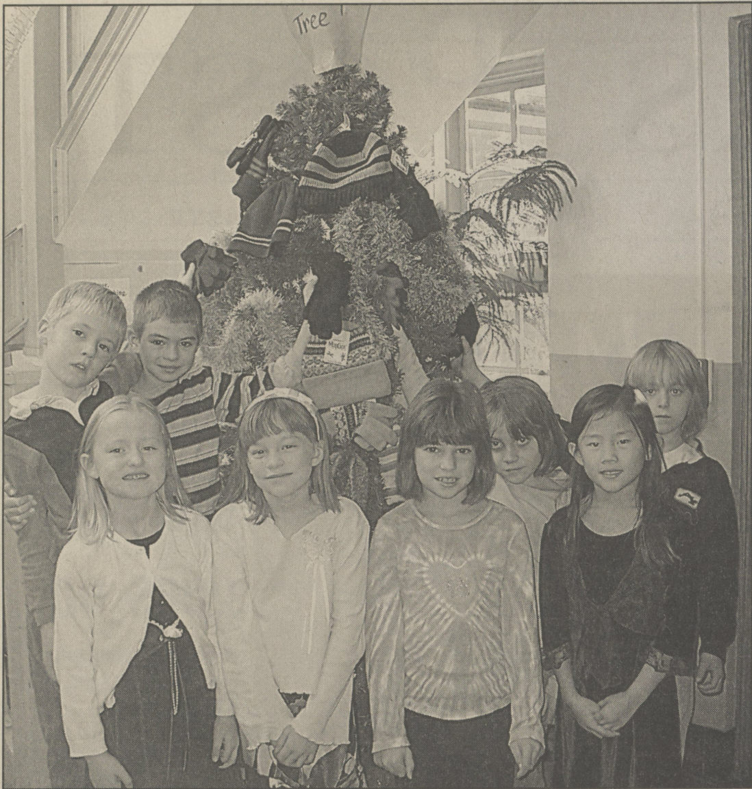
The second grade Sunday School class of the Shavertown United Methodist Church recently collected mittens and scarves for the Annual Mitten Tree project.