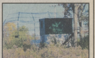
The hole story, Page 3