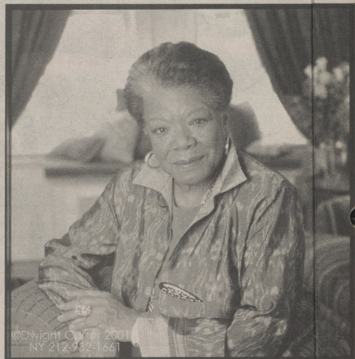
Maya Angelou is scheduled to speak at 8 p.m. on Friday, Nov. 2, at the Anderson Center at Misericordia University

Jr.'s request, she was the coordinator of the Southern Christian Leadership Conference in 1959-60.