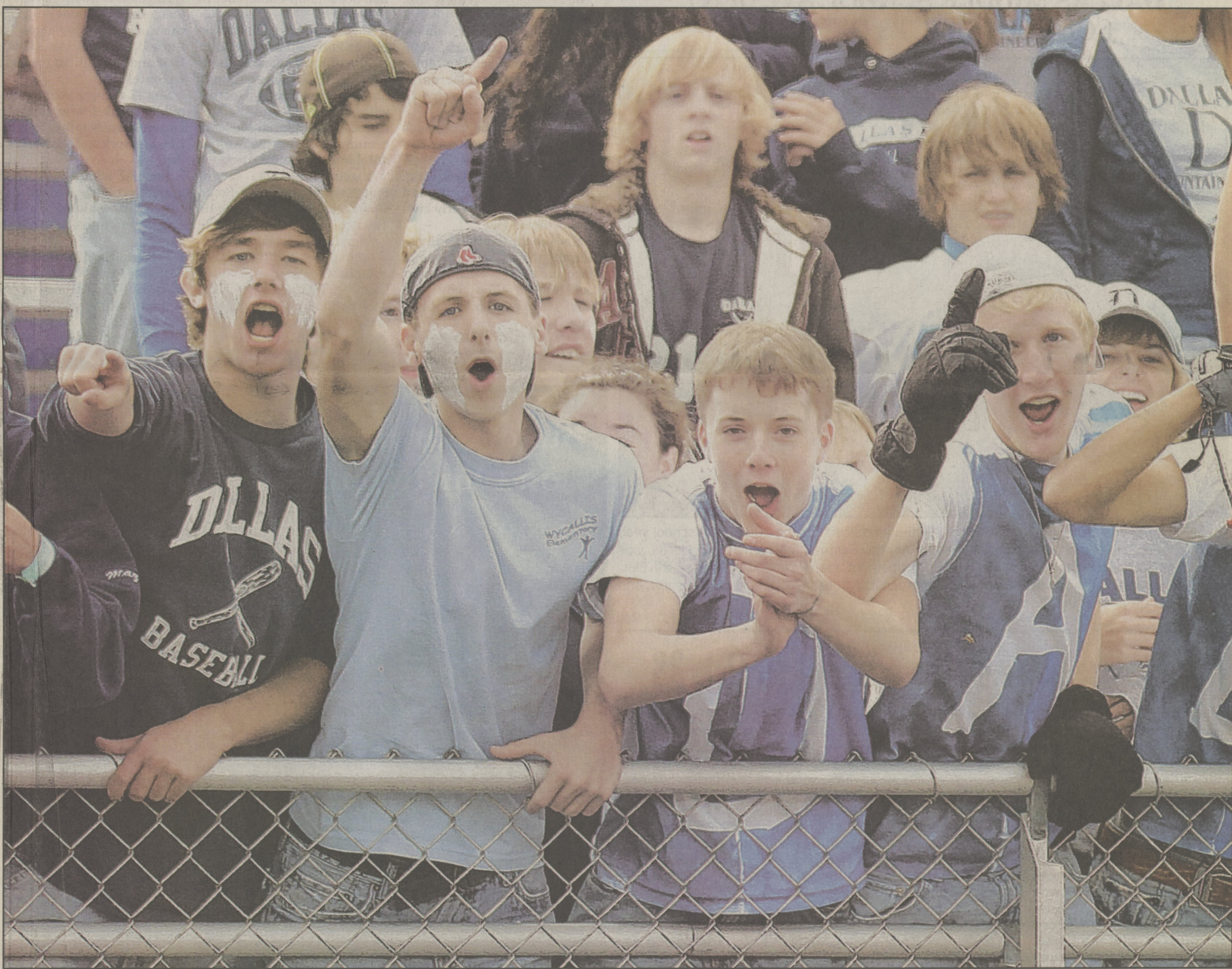
Members of the Dallas High School student body cheer on the football team during the Homecoming Game last Saturday.