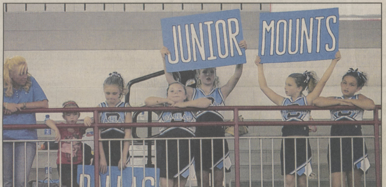
Dallas Junior Mounts "C" team cheerleading squad cheers for the "B" team cheerleaders.