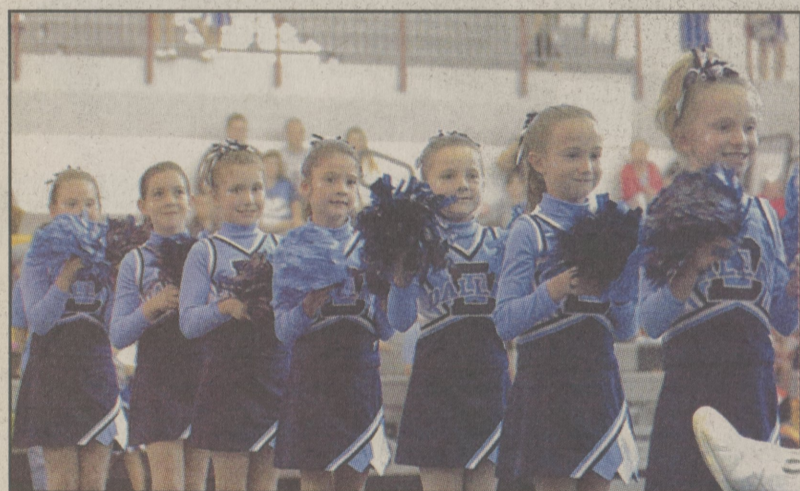
Members of the Dallas Junior Mounts "C" team cheerleading squad perform in competition.