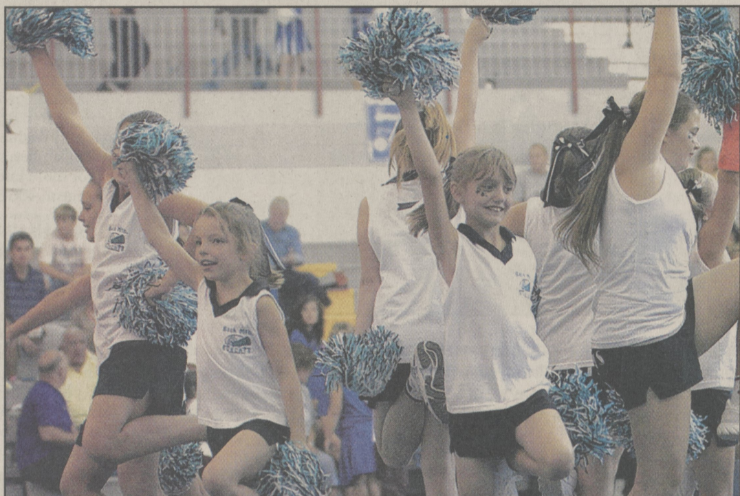
Members of the Bobcats "B" team cheerleading squad perform in competition.