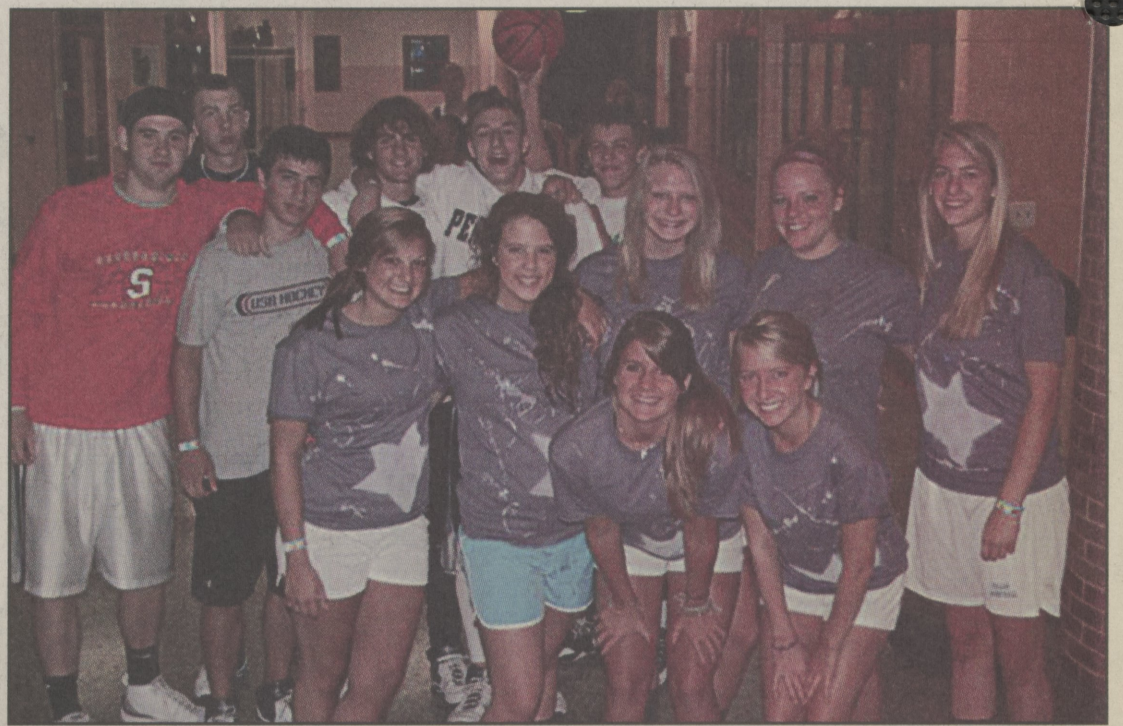
More than 100 students from Dallas, Lehman, Holy Redeemer and other schools from as far away as Scranton participated in a student-organized fundraiser at Lake-Lehman High School recently.