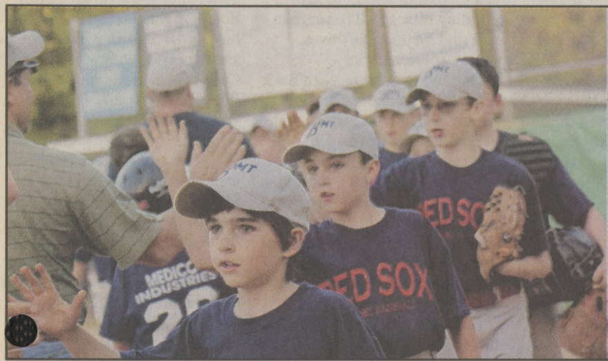
Good game, guys! The Dallas Red Sox defeated the Yankees, 8-6, in Back Mountain Little League action.