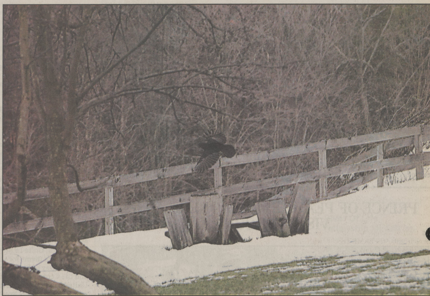
In our memory and hopes, April is all sunshine, daffodils and bunnies. Reality, however, can be cold, a conflict between emerging spring and reluctantly departing winter. And the battle has unexpected victims, left to scrounge, scratch and search for sustenance and survival.

While your children are busy planning to participate in the above events, it's a good time for you to continue your spring-cleaning! Remember that the library is now accepting items for the Nearly Old Booth for the upcoming library auction to be held July 5, 6, 7 and 8. Please call the library before dropping off your unused and unwanted items. Antiques, porcelain collectibles and other unusual items are of special interest.