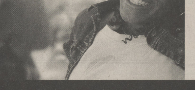
© 2007 College Misericordia, Founded and Sponsored by the Sisters of Mercy