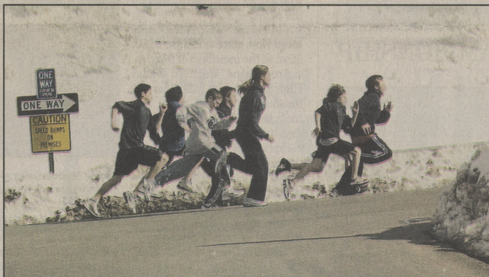
Members of the Dallas track team run in small groups around mounds of piled snow in the school parking lot.

The temperatures still might hover around freezing and a few inches of snow remain on the ground, but that isn't stopping the spring sports teams at Lake-Lehman and Dallas from getting ready for the upcoming season. The baseball and softball teams have been practicing inside for several weeks. The girls soccer teams have also been conditioning, while the track and field athletes have been trying to find a clear spot in the school's parking lot. The tennis teams have been clearing snow off the court to practice. Meanwhile, the boys volleyball teams are going through their practices without a weather-related care in the world. Some of the sports begin regular season competition in the Wyoming Valley Conference this week, while most get under way the first week of April. Look for a preview of the spring sports teams in a future edition of The Dallas Post.