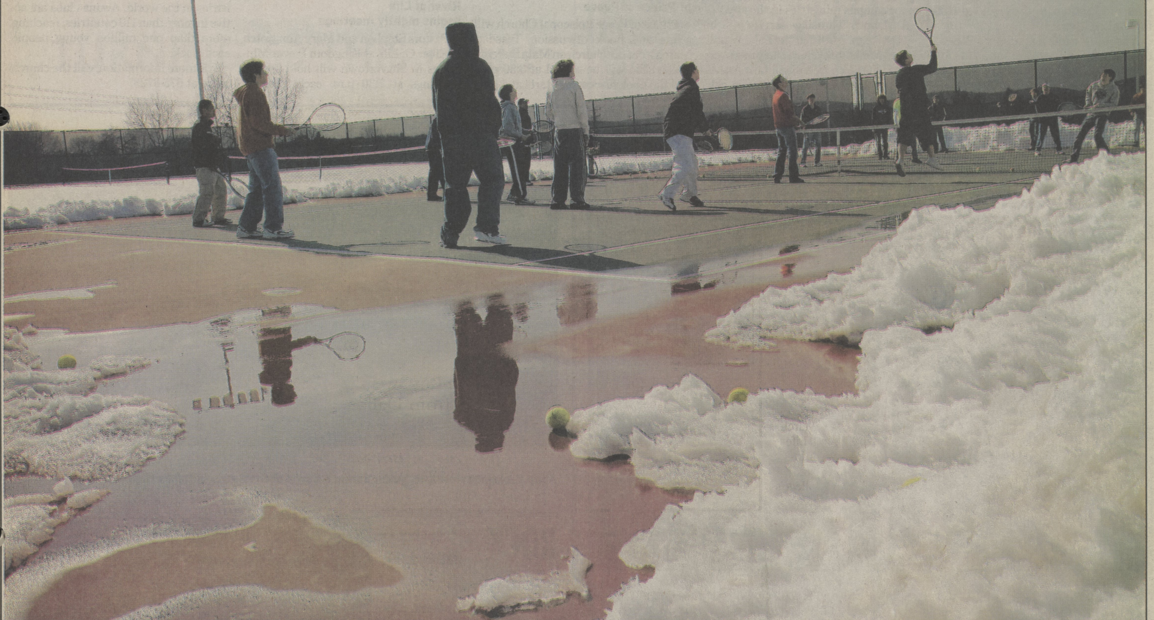
Members of the Dallas tennis team practice despite the limited space on the court.