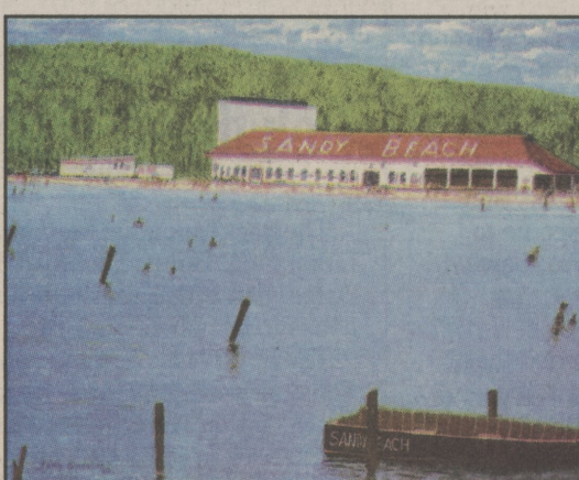
A painting done by depicts Sandy Beach at Harveys Lake in the early 1950s.