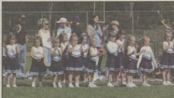
The Dallas Junior Mounts D team cheerleaders provided some enthusiasm during a game last weekend.