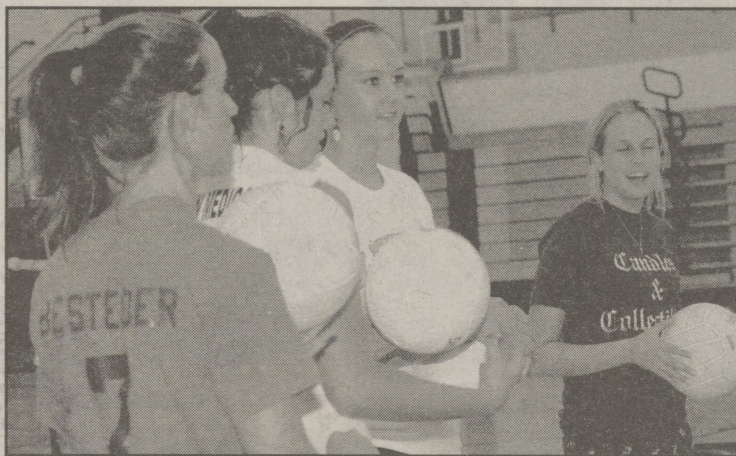
A group of Lake-Lehman volleyball players take a break during practice. The Black Knights hope to have another successful season.

girls," said the Lake-Lehman coach, who was an all-state player in 2000. "They're getting better and they're starting to gel. The seniors give us some good leadership and the younger players have some talent. We're definitely shooting for the playoffs. Why not? But it's too early in the season to start thinking about the playoffs."