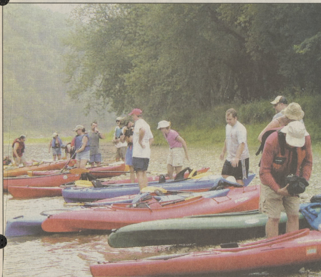
Members of the North Branch Land Trust get ready for last year's trip on the Susquehanna River.

Wednesday through Friday; and 3-10 p.m. Saturday and Sunday. The Legion has two halls available to be rented for any occasion and catering is available. For more information, call 639-2122.