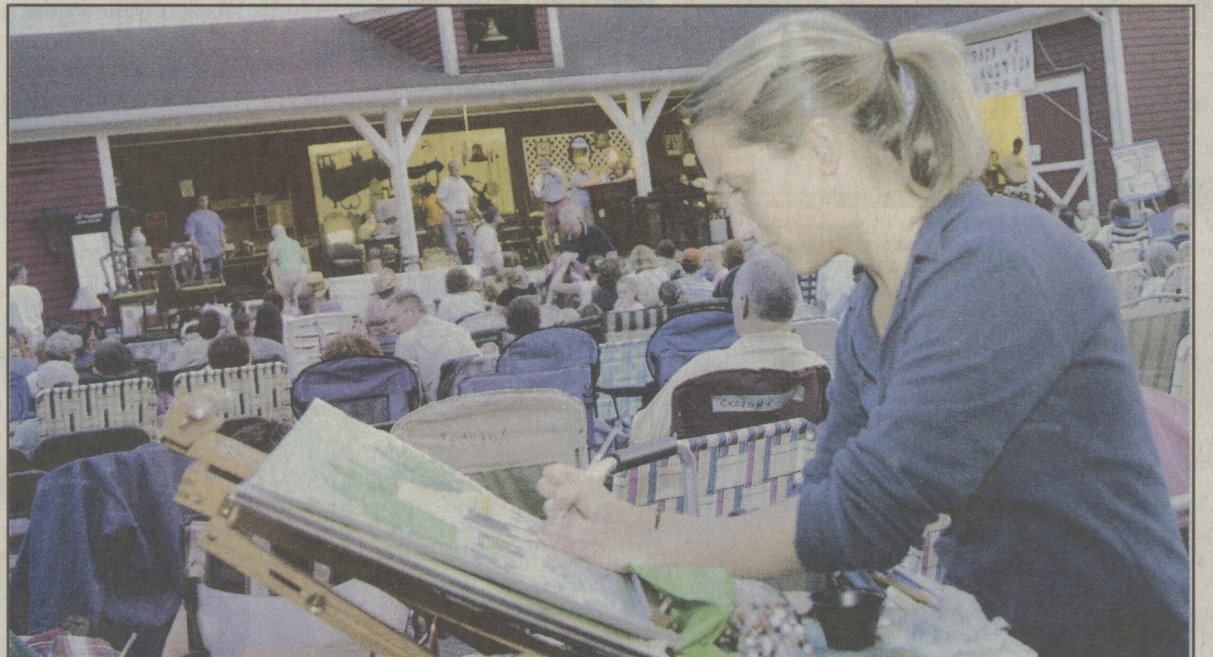
works' first season of "Project People check out the Odds and Ends booth during the first day of the 60th annual Back Mountain Memorial Library Auction.