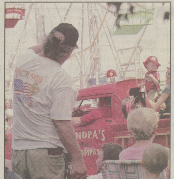
Residents of Sweet Valley enjoyed their annual Memorial Day carnival.