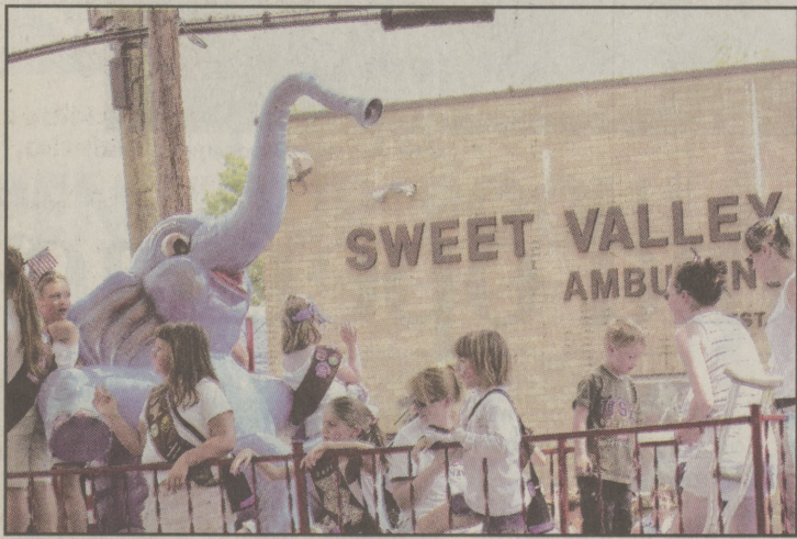
Girl Scouts riding on a float pass the Sweet Valley Fire Department.