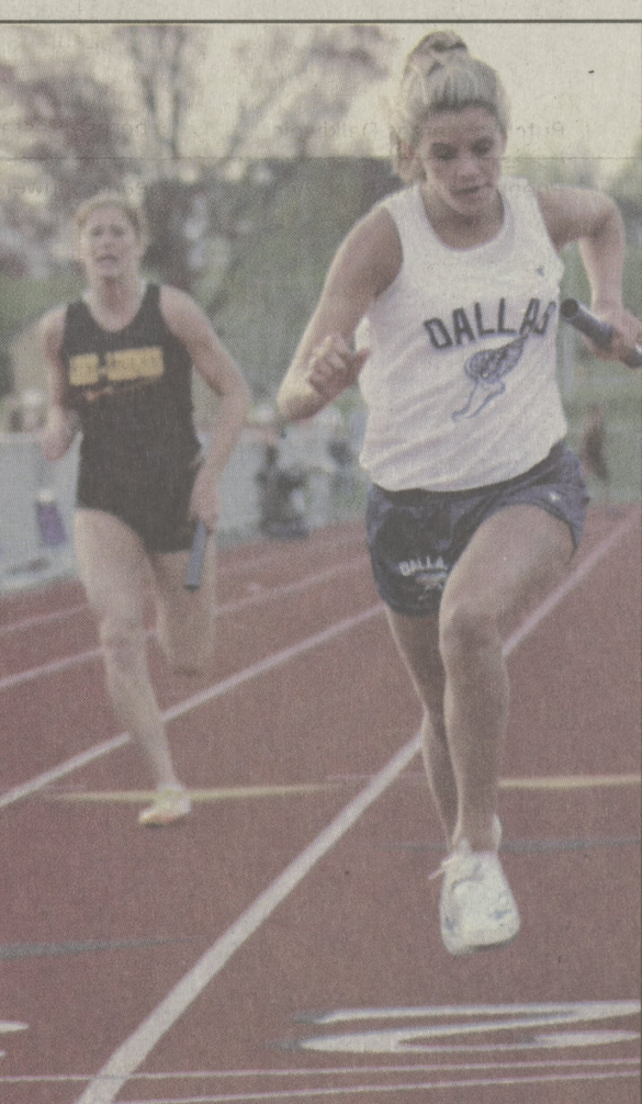
won the Danilians