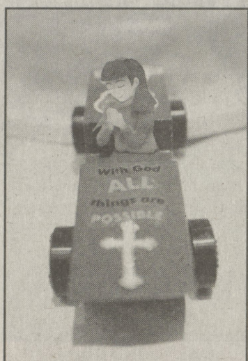
Kayleigh Peterson's race car featured a message.