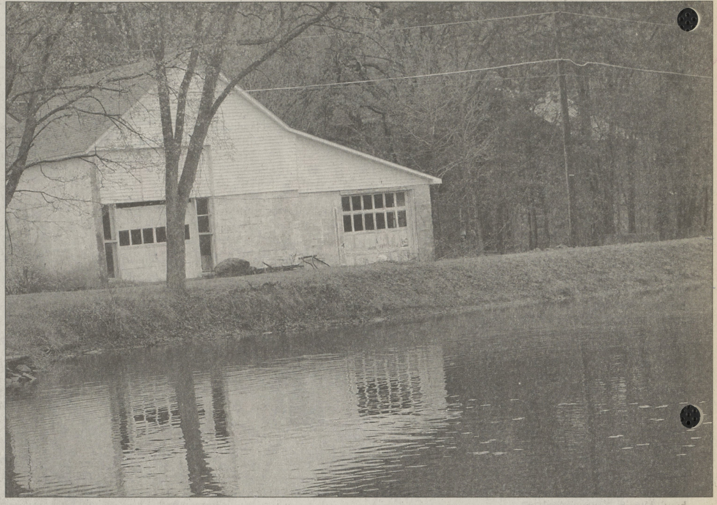
Patterns on water.