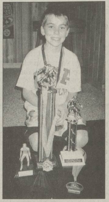
Racking up trophies

Send your sports reports by e-mall thepost@leader.net