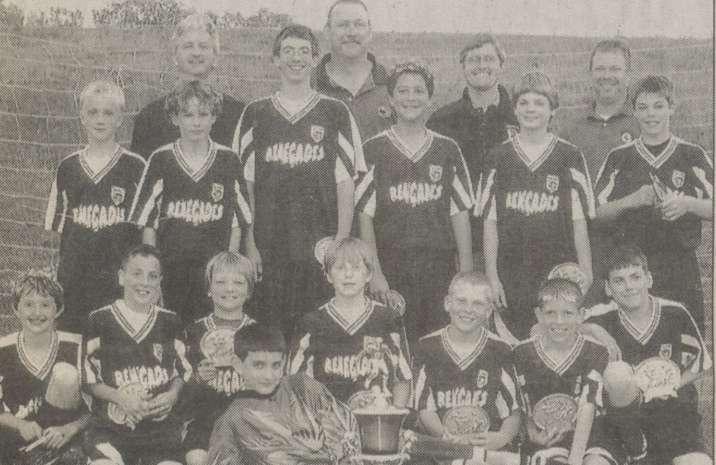
Renegades win U-12 Spring Inodor title