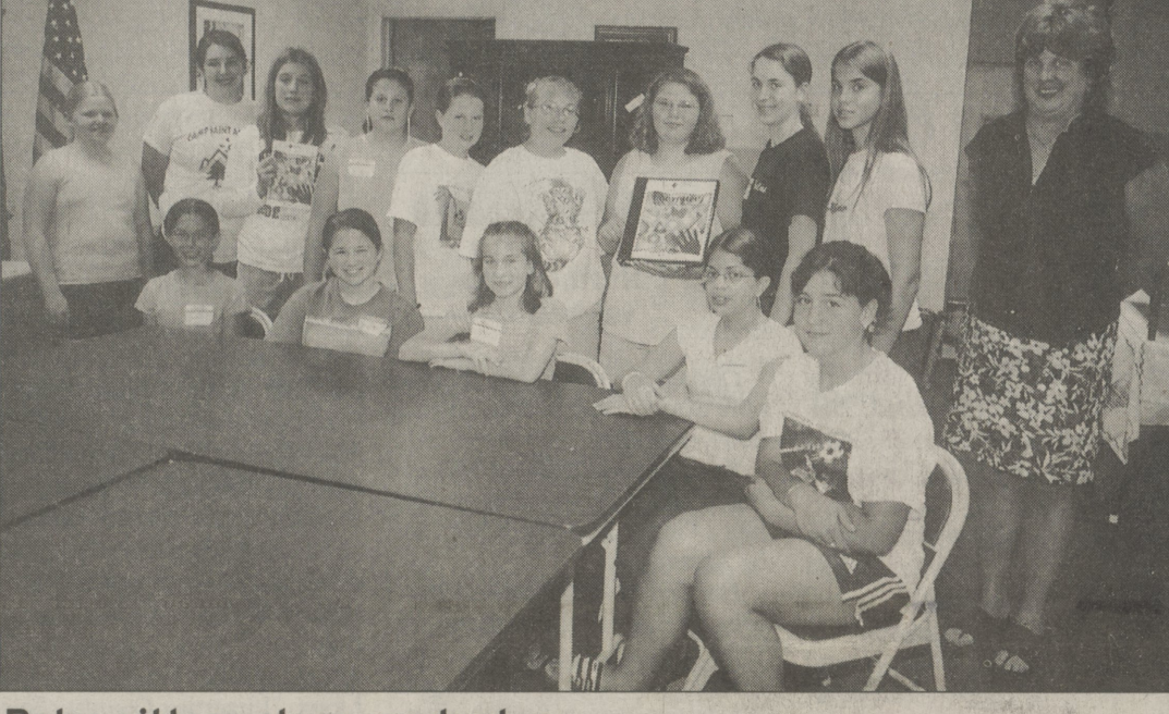
Baby-sitters class graduates

Members will available from 6-8 p.m. on Tuesday, Wednesday and Thursday evenings, or call 675-5654.