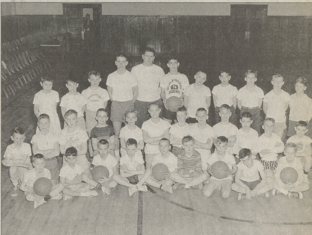
March Madness, 1959

We've been digging through our pile of old photos, and thought it would be fun to share some of them with you. Space allowing, we'll publish a scene from the Back Mountain's past each week on this page. Sometimes we'll be able to tell you about the event and the people in the frame, and sometimes we'll be clueless. That's when you can help — if you know names and details, please get them to us and we'll do our best to fill in the blanks for our readers. E-mail is the best communication method, so if you can, send info to: thepost@leader.net. Otherwise, send a fax to 675-3650, call 675-5211 or drop a note to: The Post, 15 N. Main St., Wilkes-Barre PA 18711.