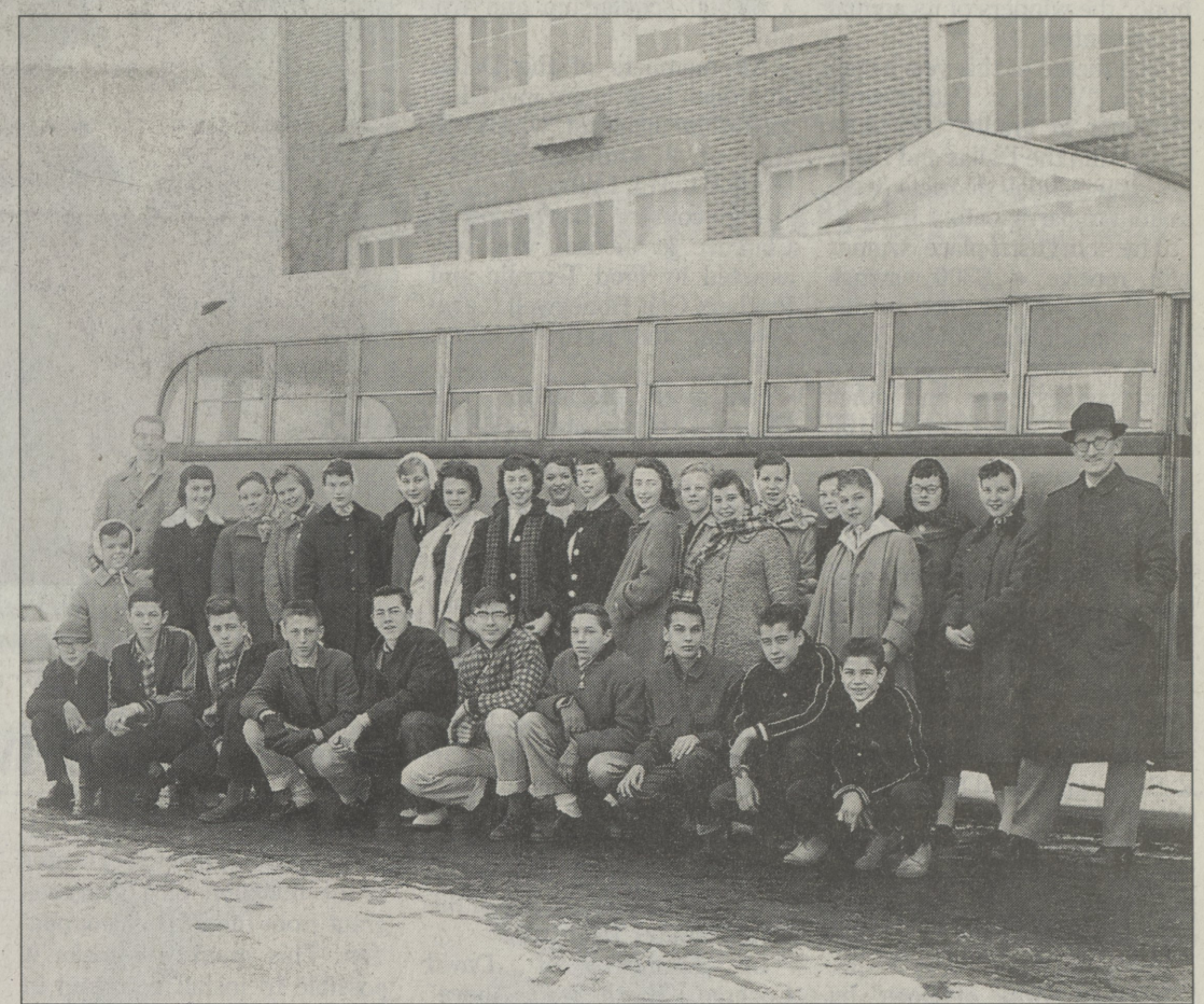
Field trip — In 1958, students from Dallas-Franklin-Monroe were ready to board the bus for a field trip. Do you know who they are and where they were going?

We've been digging through our pile of old photos, and thought it would be fun to share some of them with you. Space allowing, we'll publish a scene from the Back Mountain's past each week on this page. Sometimes we'll be able to tell you about the event and the people in the frame, and sometimes we'll be clueless. That's when you can help — if you know names and details, please get them to us and we'll do our best to fill in the blanks for our readers. E-mail is the best communication method, so if you can, send info to: thepost@leader.net. Otherwise, send a fax to 675-3650, call 675-5211 or drop a note to: The Post, 15 N. Main St., Wilkes-Barre PA 18711.