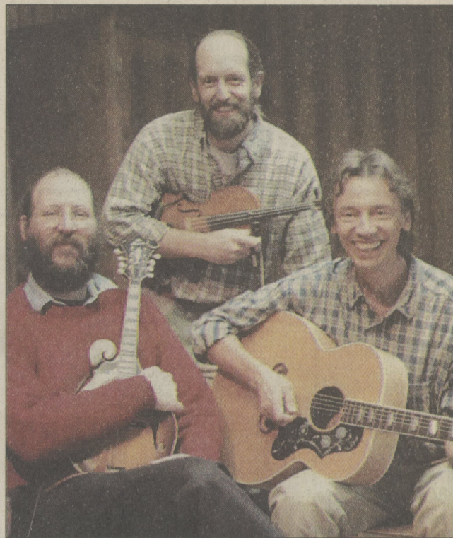
The band Medicinal Purpose will perform at the Feb. 7 New England Contra Dance.

Contra dancing is an evening of fun, featuring dancing in "sets" of about a dozen couples. Contra dancing is non-competitive; the main objective is to enjoy yourself with other fun-loving people. You don't have to take a course before you're considered experienced enough to dance the whole evening. Beginners are always welcome, and don't need to bring a partner. Further information is available at 333-4007.