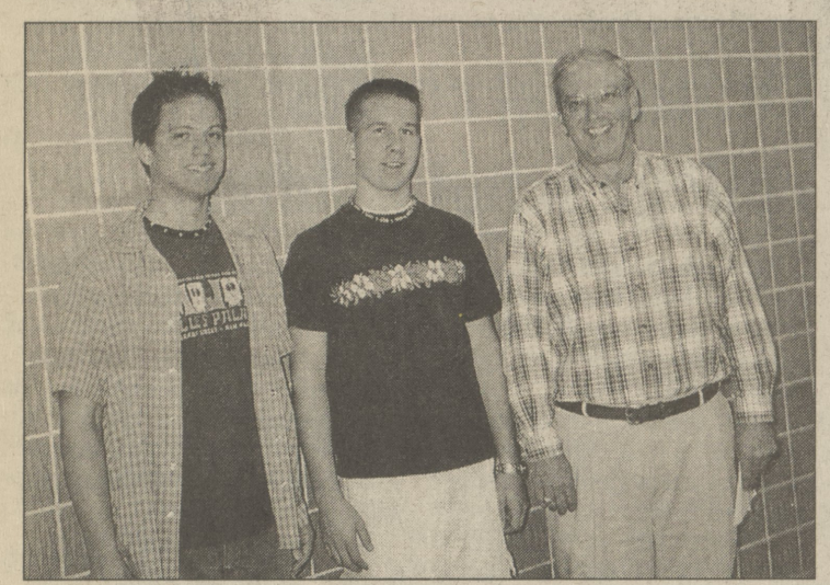
Perfect scores on math SAT

Spring sports physicals will be held on February 5 and February 12 at 8:30 a.m. Parent permission forms are available in the school office and must be completed and returned to the nurse prior to the examination. Any student who plans to play baseball, softball, or track and field in the spring is required to have a physical before attending the first day of practice.