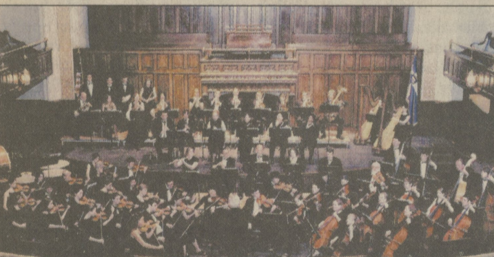
The Wyoming Seminary/PAI Civic Symphony concert will take place Dec. 14 in the Great Hall on Wyoming Avenue.