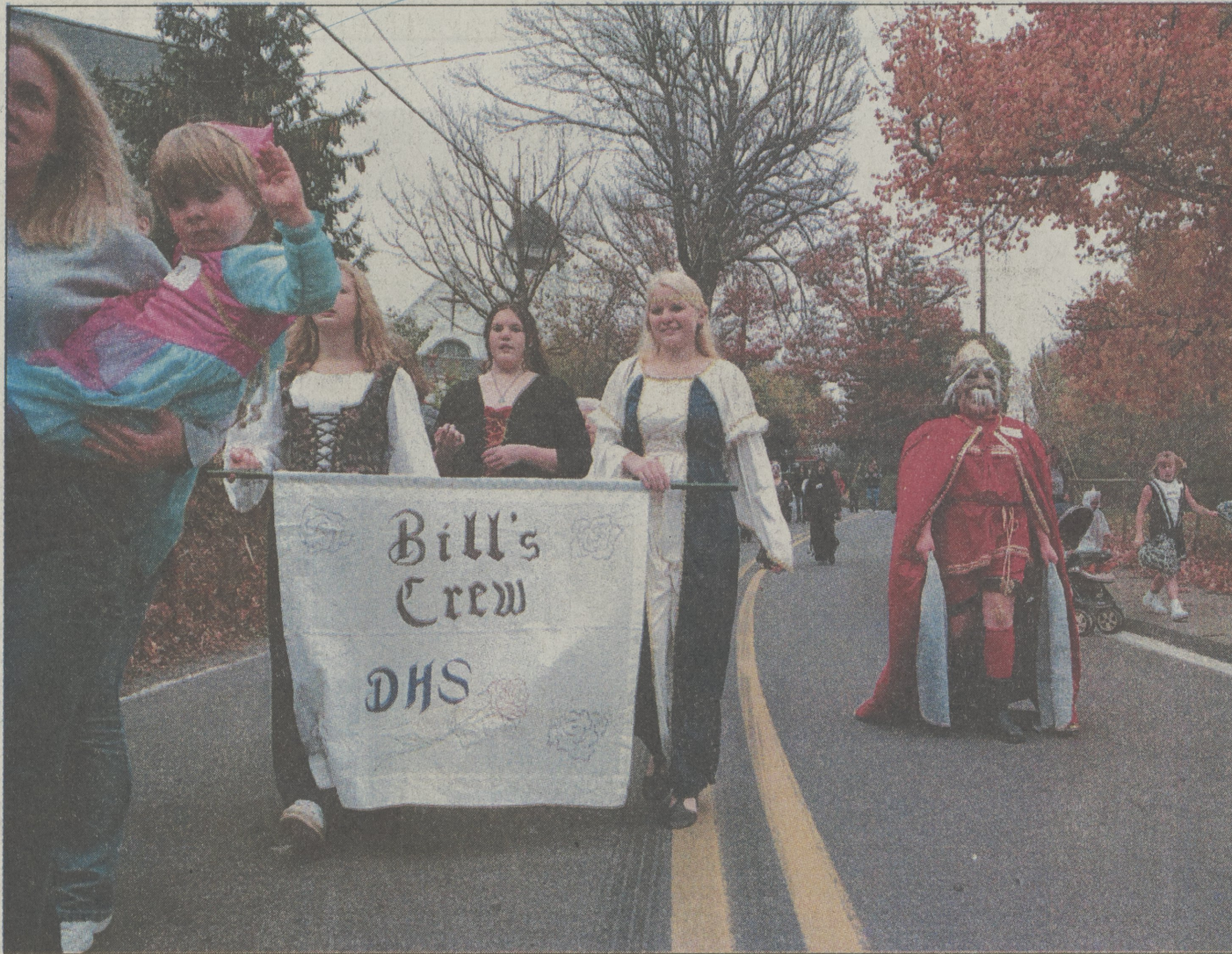
Costumed characters streamed down Church Street on their way to the awards presentation and party that followed. The event is sponsored by the Dallas Kiwanis Club, with help from the Back Mountain Business & Professional Ass'n.

The rain held off long enough for the Dallas Kiwanis Halloween parade to be completed for the 55th time Sunday, October 26. Ghouls, goblins, princesses and pirates competed to win first through fifth prizes in six categories. The children assembled at the old Dallas Township School for judging, then walked down Church Street to the Eastern Star building, accompanied by shrieking fire engines from around the Back Mountain. After the prizes were awarded, everyone moved indoors for a party sponsored by the Back Mountain Business and Professional Association, featuring cider, snacks and a deejay.