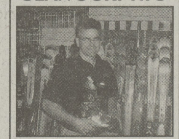
Q. Why should I get a ski helmet?

A. Protection, comfort, style and warmth. There are many good reasons, but what is important to you?