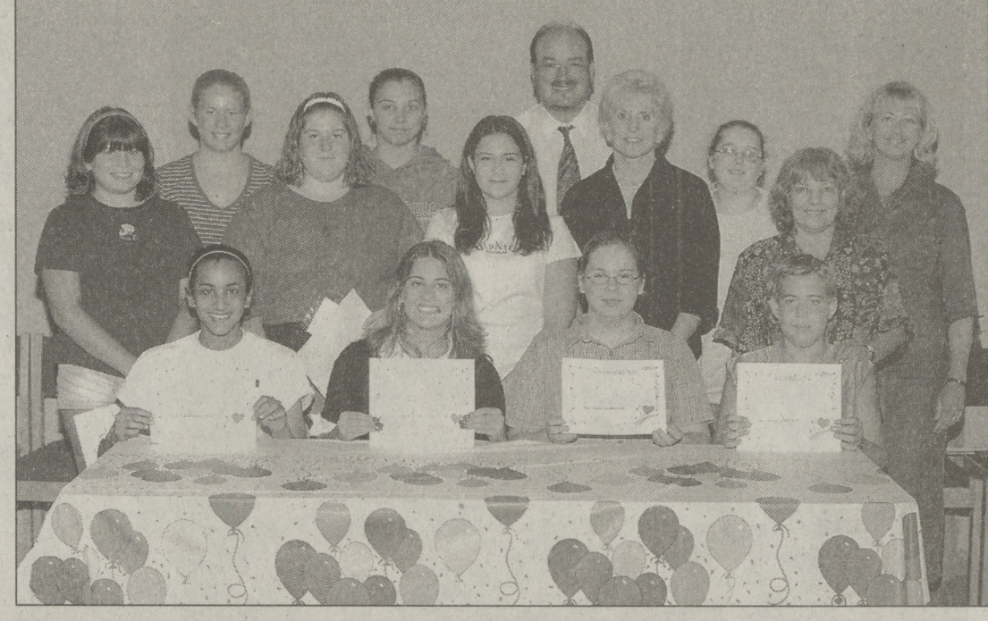
Meadow's Volunteer Appreciation Day

In addition, the hospital has developed special expertise in spinal cord injuries, cerebral palsy, scoliosis (curvature of the spine), spina bifida, hand disorders, club foot, hip disorders, brittle bone disease and juvenile rheumatoid arthritis.