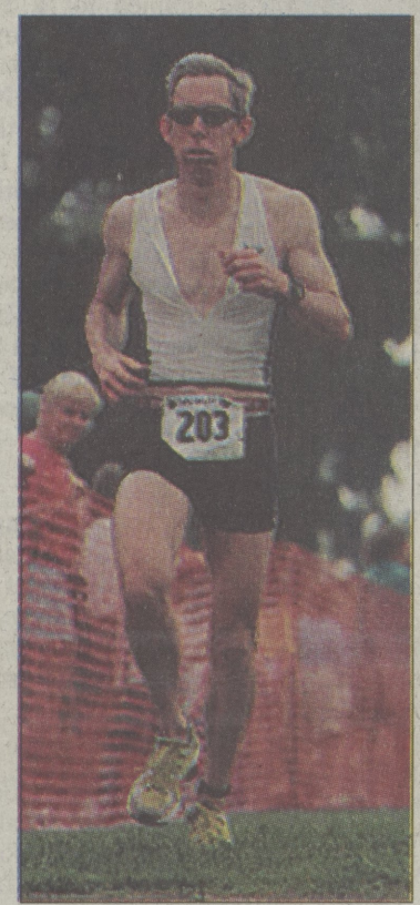
way to the finish line.

volunteers met on a regular basis to make race preparations during the seven months leading up to the event.