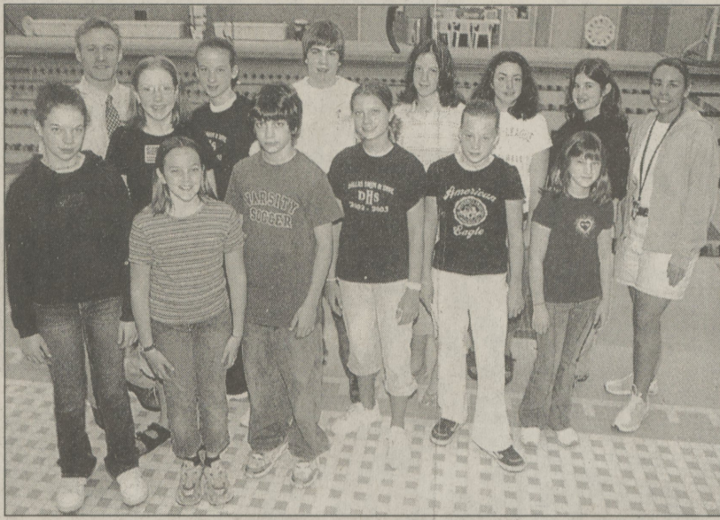
Pictured are some Dallas swimming program participants and instructors.