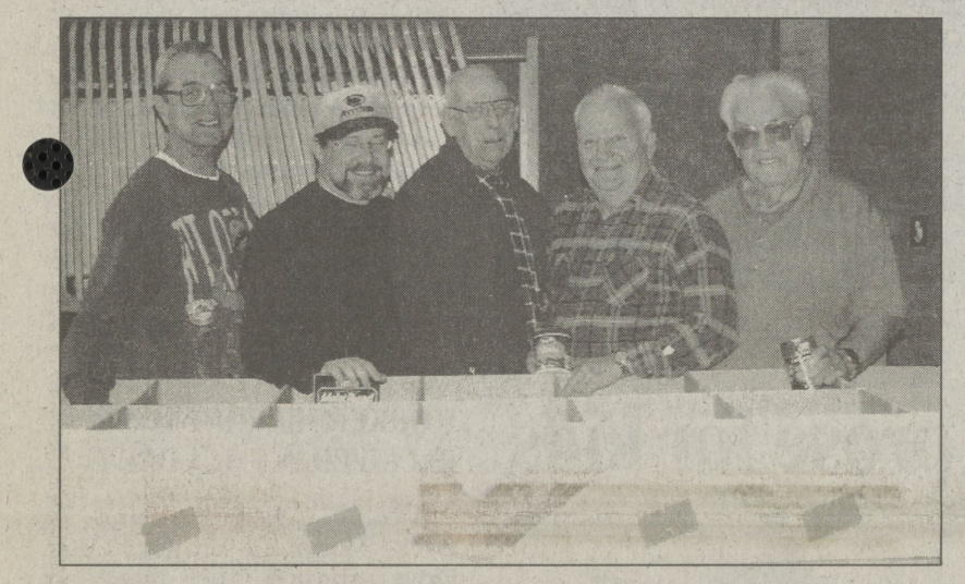
Food Pantry supplies Easter dinners

Task force meetings and committee updates are on the agenda.