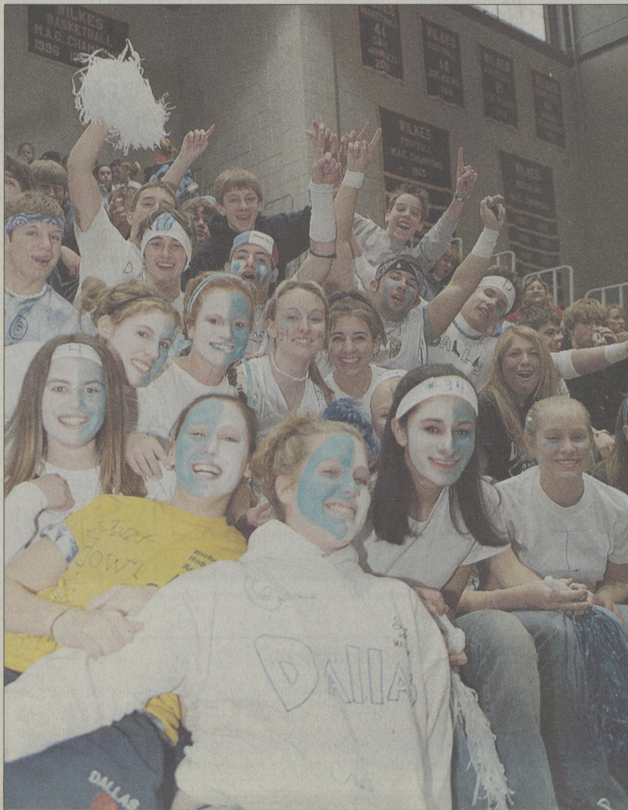
Dallas fans came ready to rock 'n' roll, with good reason.