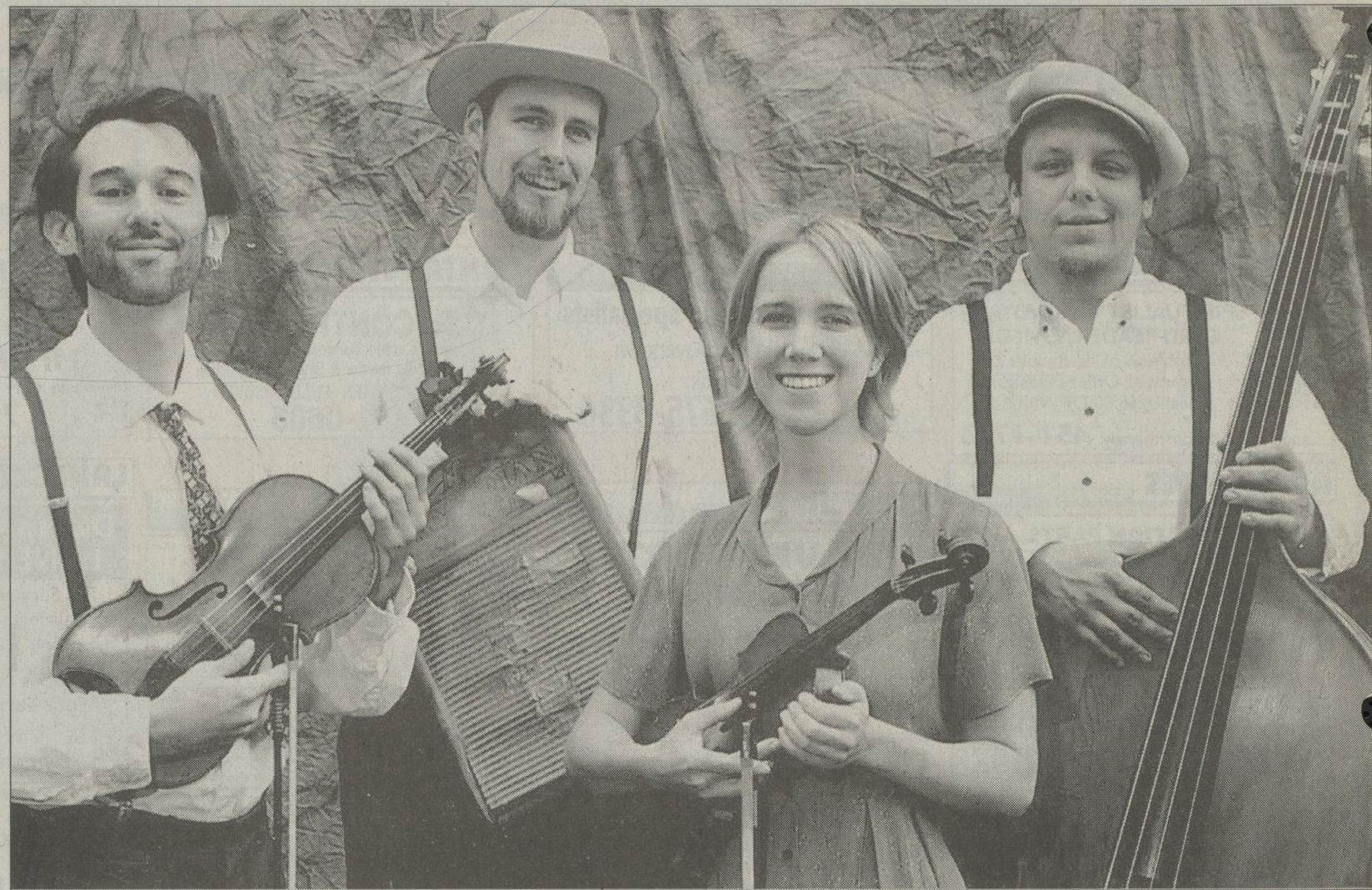
Often featured as a dance band, Flapjack is providing the music for this Saturday night's New England Contra Dance at St. Therese's Church on Pioneer Avenue in Shavertown.