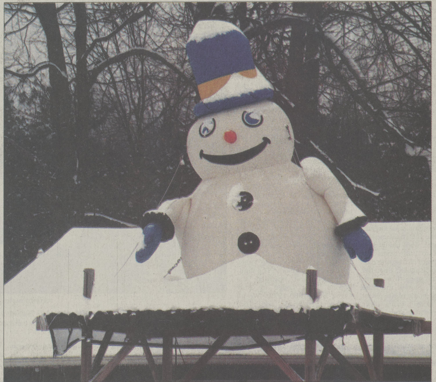
Sure, this guy thought it was all great fun. At Hoss's Garden Hut, Dallas Township.