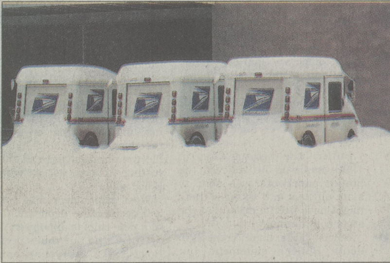
Do you think they would have moved if it wasn't President's Day?