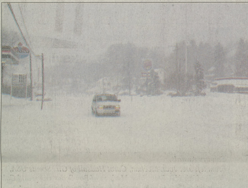
A lone mini-van navigated Route 309 at the height of the storm.