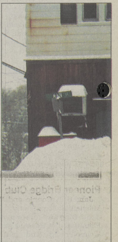
Snowy sign in Dallas.