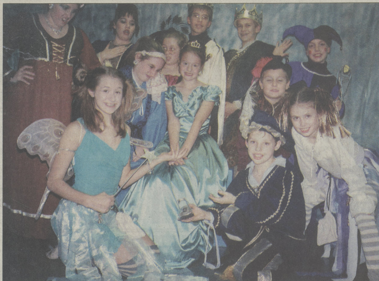
Cast members playing in Cinderella and The Christmas Ball