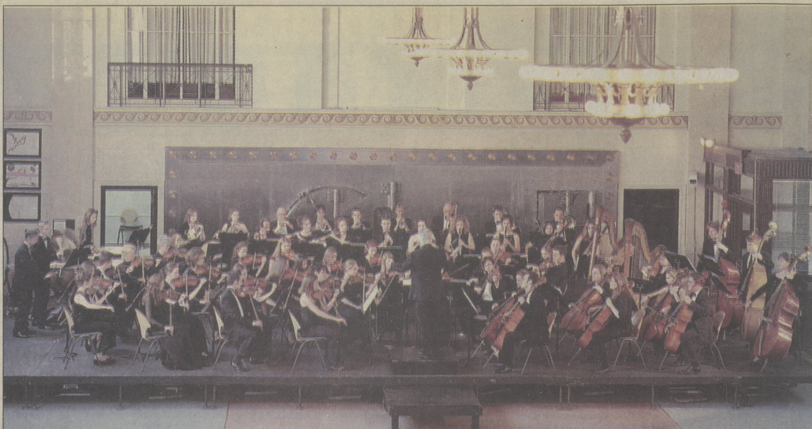
The Wyoming Seminary/PAI Civic Symphony will perform a program of Russian music Sunday, December 8.

Friday, Nov 29 - GATE OF HEAVEN CHURCH , 10 Machell Ave., Dallas, 1 p.m. - 6 p.m.