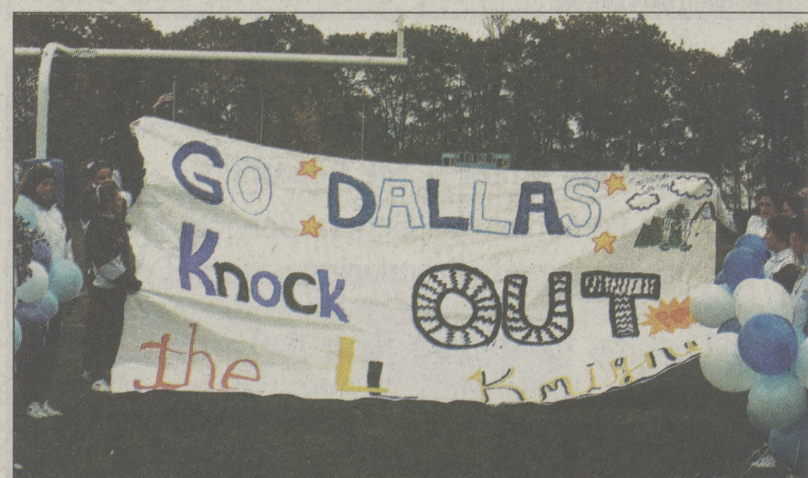
Dallas cheerleaders held up the traditional "Beat Lehman" banner.