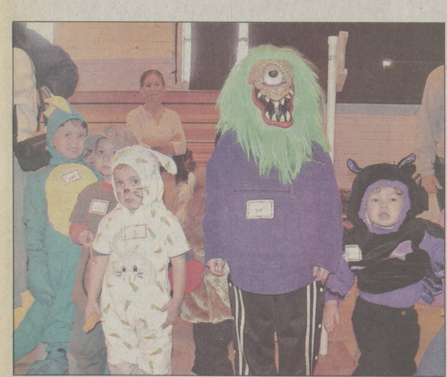
Children in the Most Original category wait for their to be judged.