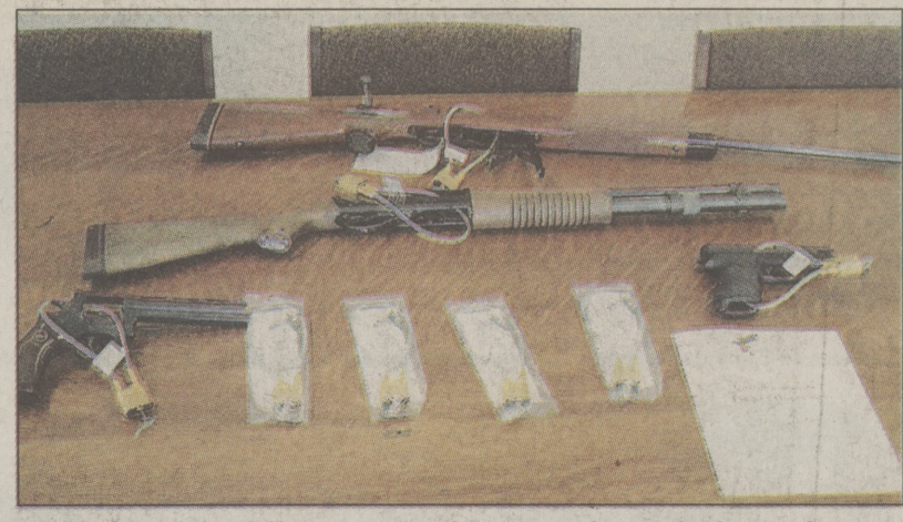
A display of the different types of firearms the gunlocks can be used on.

"It's the best secondary means of preventing someone from gaining access to them," said Balavage. He said the program would have begun earlier, but the last set of locks that came out as