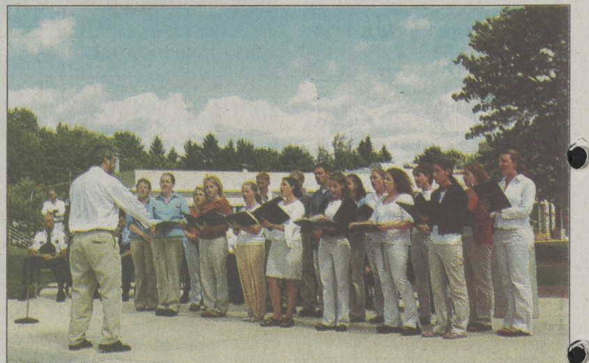
The College Misericordia Choral Sociey sings

Students, faculty and staff also recited the nine-day Novena for Justice and Peace endorsed by the U.S. Catholic Bishops and the Catholic Campaign for Human Development. The novena concluded on September 11 and afforded everyone the opportunity to discuss and pray for the intention of building peace and justice in the world. Many classes also recited "the Prayer of St. Francis" on a daily basis.