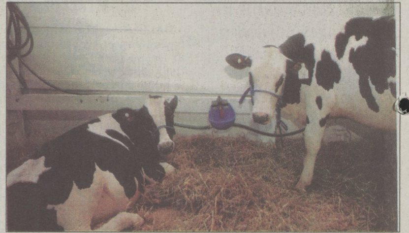
A pair of holsteins kept a wary eye on the photographer.