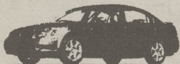
ALL NEW 2002 ALTIMA 3.5 SE 240 Horsepower - In Stock Now