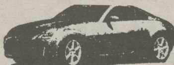
ALL NEW 2003 350Z Place Your Order Today!