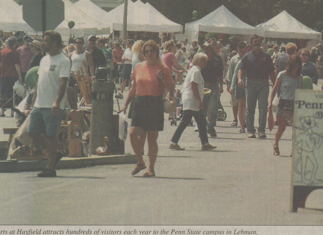
Arts at Hayfield attracts hundreds of visitors each year to the Penn State campus in Lehman.

Sat. August 31 - KUNKLE FIRE COMPANY'S ANNUAL FLEA MARKET 9 a.m.-? at the Kunkle Fire Co. Grounds. Rain date Sunday, September 1. Held in conjunction with chicken barbeque. Dinners served at the Kunkle Fire Co. Social Hall from 4-7 p.m. rain or shine. Adults $6.50. Children under 10 $3.50. Halves $3. To reserve space call 675-2728 or 675-3334.