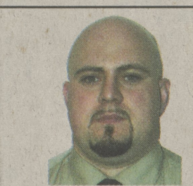
From the bullpen